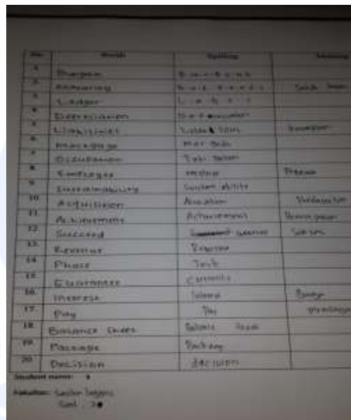
1 st Picture. Illustration of handwriting by Students at Universitas Putra Indonesia.

From the data above, the 2 nd semester student of Universitas Putra Indonesia name “student 1” from faculty of Humanities insert deletion concern with Apocop, haplology, and syncope. She did not write the word properly, however she knew the pronunciation of several words but did not know how to spell it.