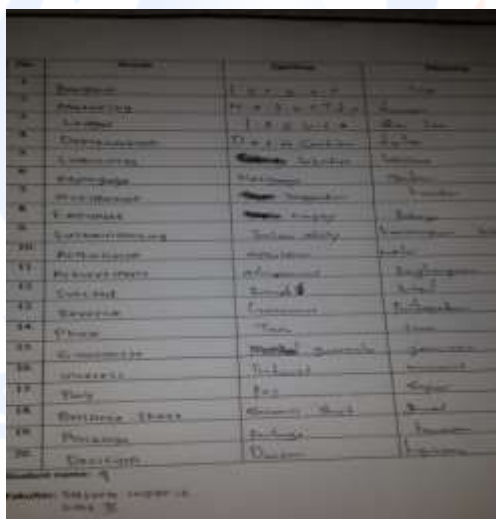
4 th Picture. Illustration of handwriting by Students at Universitas Putra Indonesia.

From the data above, the 2 nd semester student of Universitas Putra Indonesia name “student 4” from faculty of Humanities insert deletion concern with apocop and syncope. He did not write the word properly, however he knew the pronunciation of several words but did not know how to spell it.