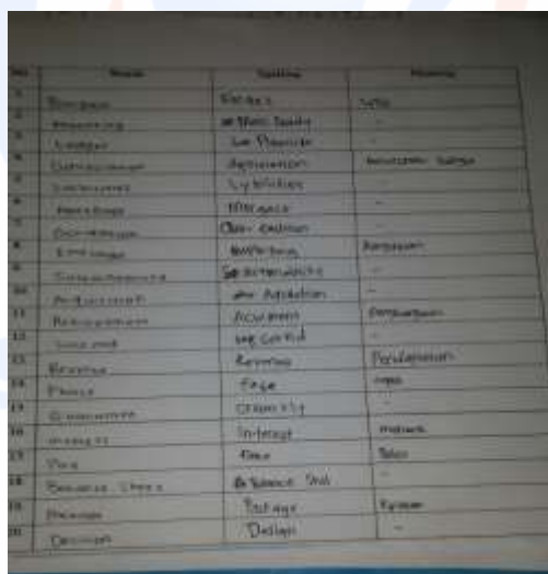
3 rd Picture. Illustration of handwriting by Students at Universitas Putra Indonesia.

From the data above, the 3 rd semester student of Universitas Putra Indonesia name “student 3” from faculty of Economics insert deletion concern with Apocop and syncope. He did not write the word properly, however she knew the pronunciation of several words but did not know how to spell it.