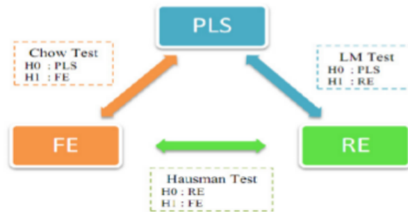
Figure 2. Selecting the best panel model