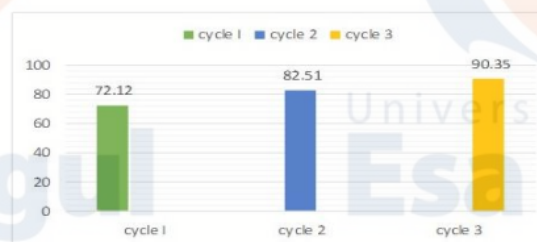
Figure 1. Graph of assessment results on aspects of student knowledge of the Departement Elementary School Teacher Education at Universitas Esa Unggul

the cycle of action given. The following is a calculation of the results of the research shown in the form of a diagram: