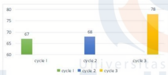
Figure 3. Graph of assessment results on aspects of application of Department students Elementary School Teacher Education at Universitas Esa Unggul towards ecological literacy

Furthermore, in obtaining the average score of aspects of student applications on increasing the Ecoliteracy cycle I reached 67.00 with sufficient categories, the second cycle reached a score of 68 with sufficient categories, and the third cycle reached a score of 78 with good categories.