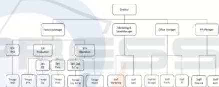
Figure 4: Organizational structure of the company

The organization is headed by a Director and 4 Managers who are divided according to their respective departments. The organisational structure of the company is shown in Figure 4.