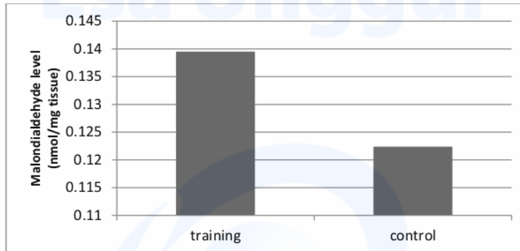
Figure 2: Comparison of Malondialdehyde (MDA) levels in the training group and control group

The level of malondialdehyde can be seen in Fig. 2. The level of malondialdehyde in the training group ( 0.1395 \pm 0.0179 nmol/mg of tissue) was higher than in the control group ( 0.1224 \pm 0.0175 nmol/mg of tissue). Fig. 2 showed that malondialdehyde level of the training group tended to increase compared to the control group, but the difference was not significant ( p = 0.084 ).