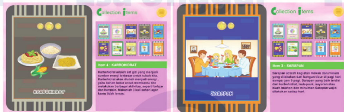
Figure 3. (a) View of card after completing Level 4; (b) View of card after completing Level 3