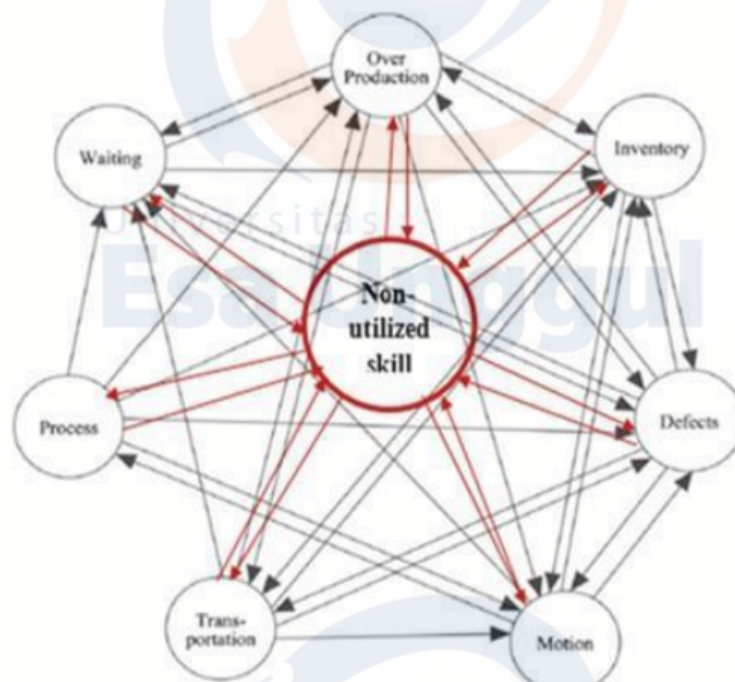
Fig. 4. Eight Waste Relationship of Lean Hospital Modification and WAM