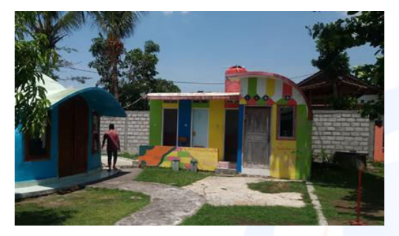
Public toilets for tourists