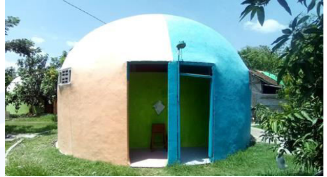
Communal toilets that are no longer functioning