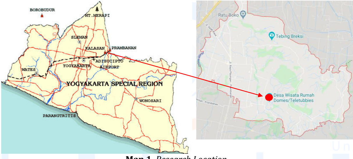
Map 1. Research Location

Tourism Village "House of Dome" is located in Sengir Hamlet, Sumberharjo Village, Prambanan District, Yogyakarta. This village is also commonly called the Teletubbies Home Tourism Village. The tourism village is around 2 hectares. The origin of the dome houses was due to a tectonic earthquake of magnitude 5.9 on Saturday, May 27, 2006, which had devastated the Yogyakarta Special Region and its surroundings (Nugroho, 2017). This dome house complex was built in 2006 as assistance from Dome for the World Foundation for earthquake victims in Nglepen Hamlet. The shape of this dome houses is unique due to the shape of a half ball with a building construction which could withstand earthquake shocks and typhoons. It is the only dome house complex in Indonesia and even in Asia. Figure 1 shows the research location.