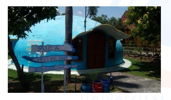
Hall as a place to watch disaster education films

International Journal of Society, Development and Environment in the Developing World Volume 4, Issue 1, April 2020 (17-34)