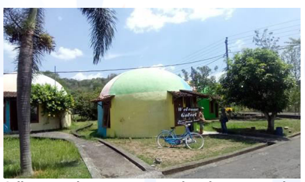
Gallery as a place to store agricultural equipment that survived the earthquake