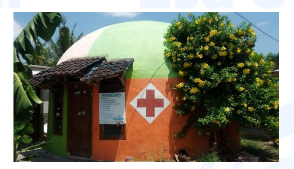
Polyclinic that is no longer functioning