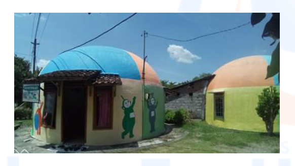
Secretariat of Dome House of Tourism Village