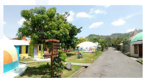
A village road with a background in Teletubbies Hill