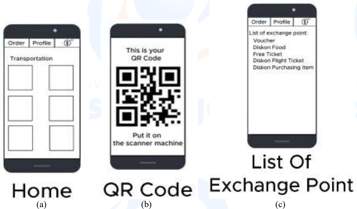
Figure 5. (a) Homepage user interface, (b) Mobile phone scan the barcode, (c) Exchange the point to e-commerce

The point can be exchanged with an item from partners such as a voucher for buying food, tickets (airplane, train, or any other transportation), a voucher for a homestay, discount voucher when purchasing in web e-commerce. The benefit of this will not just affect the customer but also will give an excellent opportunity for an E-Commerce company. Even also, it will change the payment system in Indonesia for using the QR-Code payment. Not only that, but the user can also get the free point once a day by watching the partnership e-commerce ads.