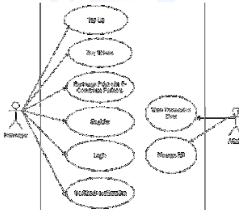
Figure 3. Uses case of the proposed system

Based on the research, many challenges can be solved. We want to propose a system of e-payment that can be used by all users. This e-payment integrated with public transportation in Jakarta. This e-payment will have a partnership with several banks in Indonesia. However, we have limitations for the type of public transportation that can be ridden by the user. The public transportation should have its station, such as TransJakarta, train, and MRT. This is because we are using QR-Code to be scanned in a station. Use case in figure 3 shows the process where the passenger can register their account, do the login to the system, top-up balance, buy the tickets, shows the cashback and exchange the point with E-commerce system partners. Meanwhile, admin actor can view transaction data and manage the database in the system.