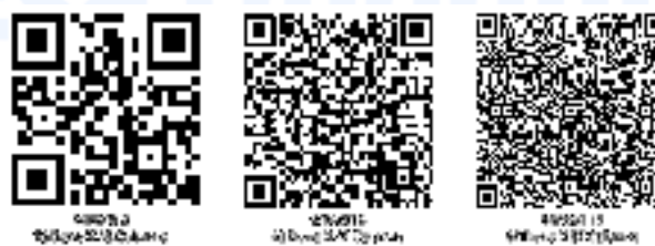
Figure 2. Type of QR-Code. [Retrieved from https://blog.qrstuff.com/2011/01/18/what-size-should-a-qr- ]

Furthermore, the E-Commerce business in Indonesia has multiplied that opened up many opportunities. For those who do not know about E-Commerce business. E-Commerce business is a business that uses technology where we could buy and sell items, primarily on the internet [16,17]. E-Commerce growth also runs parallel with the increase of e-wallet. E-Wallet nowadays has to implement QR-Pay to make the payment system more accessible, faster, and secure. QR-Pay uses photon checking encryption algorithm where we can encode and pack a picture containing essential data like ID, Photo, Content or URL and make it into different types of size like little, medium or large [18,19].