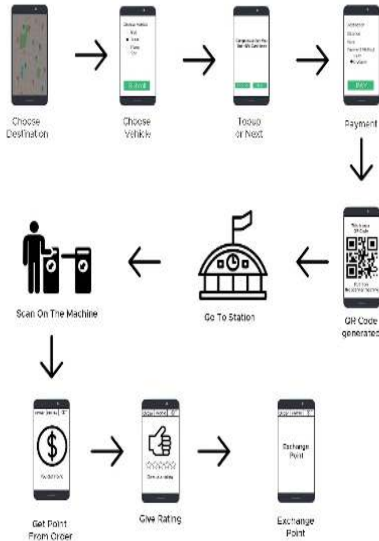
Figure 4. How the systems works

Every user has their account, so if they want to use e-payment, a user must register first. The e-payment will show a display of varieties of public transportation available at the current hour. After users choose the public transportation that they want to ride, the system will calculate prices to be paid. After that system will generate the QR-Code to be scanned on the machine when the user is riding public transportation. If QR is not being used, after two hours, QR-Code is expired, and the system will send back the balance of e-payment that has been paid.