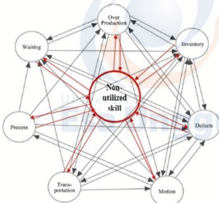
Fig. 4. Eight Waste Relationship of Lean Hospital Modification and WAM