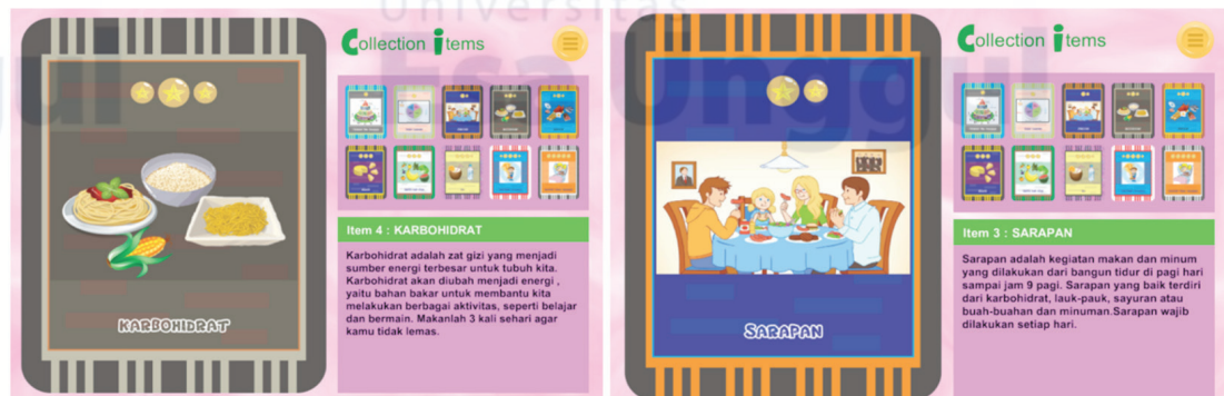
Figure 3. (a) View of card after completing Level 4; (b) View of card after completing Level 3