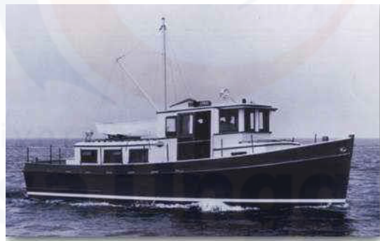
Figure 1: American Marine Ltd. Wooden Classic Boat

GrandbanksYachts (GBY) is an American company that has long been capable of producing trawler-type fishing boats. They are known by maritime enthusiasts and hobbies worldwide because they can maintain the traditional form of ships that have become a tradition into more modern packaging. American Marine Yachts Ltd. Several design experts left American Marine shipyards to focus on producing the first of the ship designs known as Grand Banks (GB). The boat design, recognized worldwide as the Grand Banks Heritage Series, is iconic built first from wood and then, starting in 1973, starting from fiberglass at a new factory in Singapore. The fact is that the GB's general design style is widely imitated by other shipbuilders or builders for a yacht-like fleet and is sold under dozens of names. However, no one can equal the construction quality for these famous Grand banks. 1962 was the name of the shipbuilding business in Junk Bay, Hong Kong, before changing to GBY. The first product launched in 1963 left a legendary hull shape, mostly seen in the shape of the hull lines that would become known as the Grand Banks Yachts (Rochyat 2016, 70).