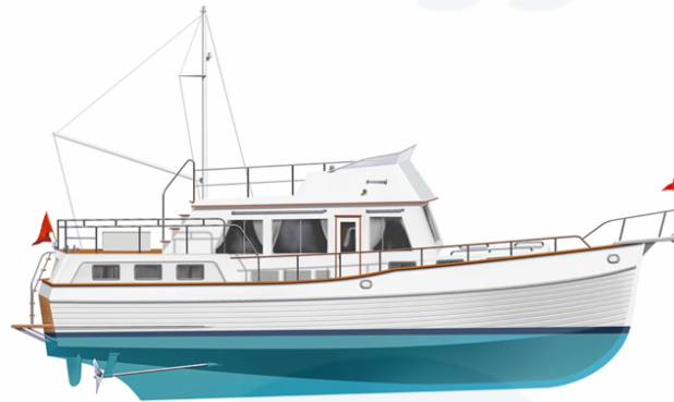
Figure 4. GB42 Sedan