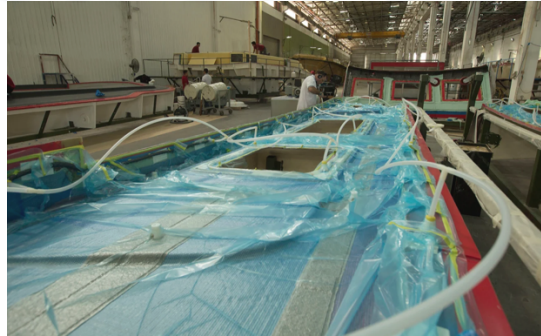
Figure 3. The hull of the new Grand Banks is made of a conventional layup of vacuum.