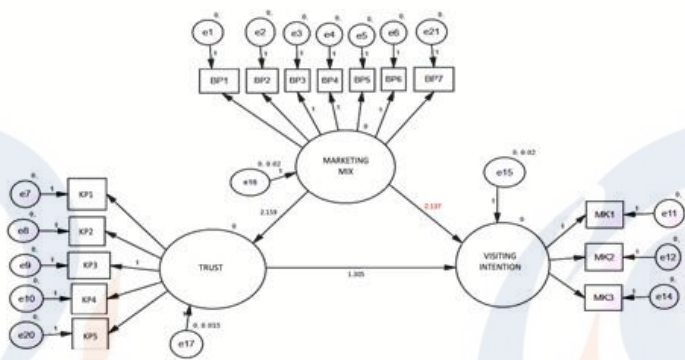
Figure 2. Structural Equation Modeling

This analysis shows that this research model can be used for further analysis as a whole model (full model) by eliminating outlier data. Outlier data are data that appear with extreme values. In this study from 200 respondents, data from 20 respondents were outlier data and were eliminated so that what could be processed in this analysis were data from 180 respondents. The results of the Structural Equation Modeling processing of this study are shown in Figure 2.