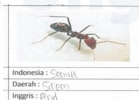
Figure 7 Written word of student 4

the word JAGONG as JAGUNG . The number of letters was still same, both of them consisted of six letters. The difference was a change towards a letter which was written on that word. The letter which changed was O became letter U. In this case, the student experienced morphographic change, that is substitution.