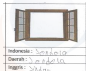
Figure 11 Written word of student 5

wrote KEMBA , not KEMBANG . The student deleted two letters in the end of the word, namely letter N and letter G. So that the word KEMBANG changed to KEMBA . And the word which was supposed to be seven letters, changed to five letters. In this case, student 5 experienced deletion when writing the word KEMBA .