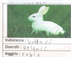
Figure 4 Written word of student 2

word, namely the letter U. So that the word that should be written BEURIT changed to BERIT . And the word which was supposed to be six letters, changed to five letters. So in this case, student 2 experienced deletion, one of morphographemic changes that indicated a deletion or omission of letter or syllable within a word.