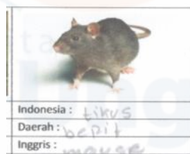
Figure 3 Written word of student 2

Figure 3 shows a picture of rat. Rat has its own word form in Sundanese language. Based on Sundanese-Indonesian Language Dictionary, rat which is known as tikus in Indonesian language, has word form BEURIT in Sundanese language. But in Figur 3 above, student 2 wrote the word BEURIT became BERIT . Student 2 eliminated a letter in the middle of the