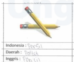
Figure 8 Written word of student 4

that student 4 experienced deletion when writing that word.