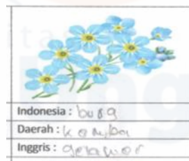
Figure 10 Written word of student 5

Figure 10 shows a picture of flower. In Indonesian language, it is called bunga but in Sundanese language, according to the Sundanese-Indonesian Language Dictionary, it is called KEMBANG . Student 5 did not write it in Sundanese language based on the Sundanese-Indonesian Language Dictionary. The student