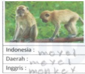
Figure 1 Written word of student 1

According to Sundanese-Indonesian Language Dictionary, the word monyet in Indonesian language (English 'monkey') if translated into Sundanese language, it becomes MONYET . It means either in Indonesian or Sundanese language, the word of monkey has the same written form, which is MONYET . But, on Figure 1, instead of writing MONYET , student 1 wrote MOYET . The word that was written by student 1 was unusual