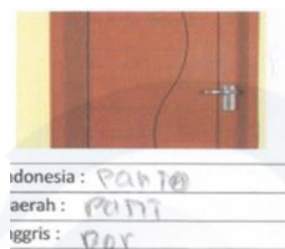
Figure 5 Written word of student 3

In this case, the student changed some letters. They were letters A and I. The letter A was changed by letter E, while the letter I was changed by letter E. This indicated that there student 2 occurred substitution when writing the word of KELENCI .