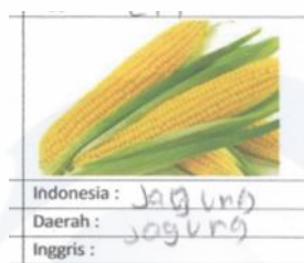
Figure 6 Written word of student 3

letter that should be placed on that word. The student did not put the letter O at the end of the word PANTO , so it became PANT . Therefore, there is a change in the number of letters in the word. The word which should consist of five letters, then became four letters. In this case, the student occurred one of morphographic changes, which was called deletion.