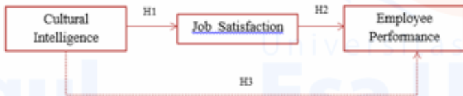
Figure 1. Research Framework

From the description above, the research model can be described as in Figure 1.