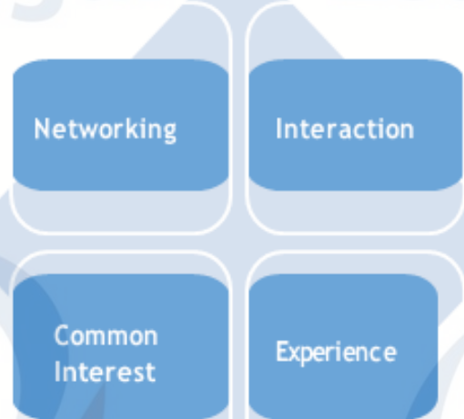
Figure 3. Networking, Interaction, Common Interest, Experience in PT. BEFINDO FOOD

The analysis result of the competitive profile matrix of the nugget business tells us that PT. BEFINDO FOOD can compete effectively with other brands of similar companies that have been known in public. The reason of the duck nugget by PT. BEFINDO FOOD offers high quality product that is implemented in its zipped lock packaging and attractive logo. In addition, this competitive thrive can be observed through marketing process of the product. PT. BEFINDO FOOD is not only apply direct selling to the customers, but also implements the key drivers in sales marketing strategies that consist of sales effectiveness, definers, shapers, enlighteners, excitors, and controllers (see Figure 3).