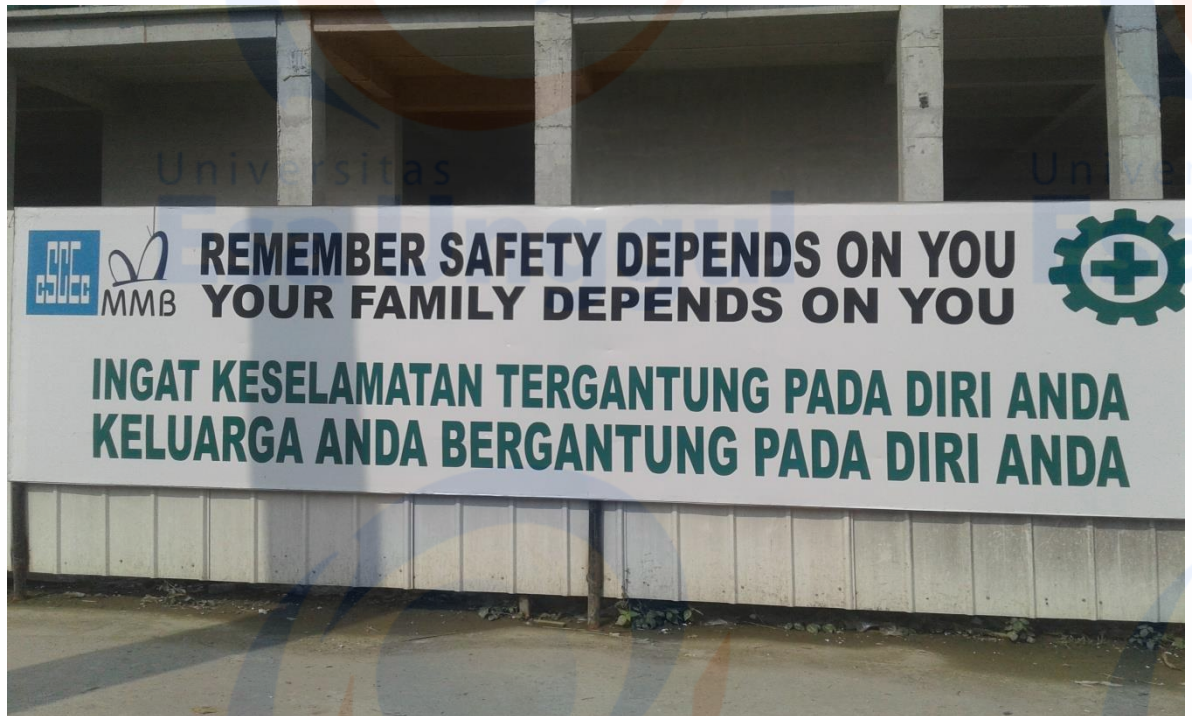
Foto Program Safety Sign