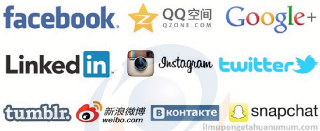
Figure 2.1 Media and Social Networking

The media, Social Media or Social Media: online interaction media, for example blogs, forums, chat applications to social networks. Social networking refers more to sites or websites that are used as a gathering place for many people without restrictions and have a bonding path like family, friends, business partners and so forth. Examples of social networks include Facebook, Twitter, Path, Tumblr, Pinterest, Instagram and others like it.