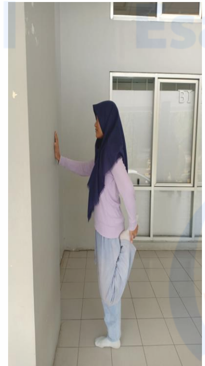
Sumber : data pribadi