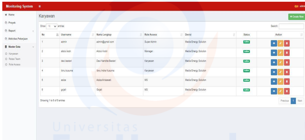
View Program : Menu karyawan - detail