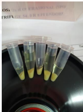
Lampiran 4. Proses Isolasi Plasmid