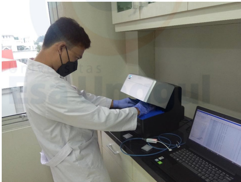
Lampiran 2. Proses Memasukkan Sampel ke Mesin PCR