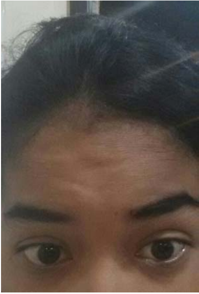
Sebelum Perlakuan I