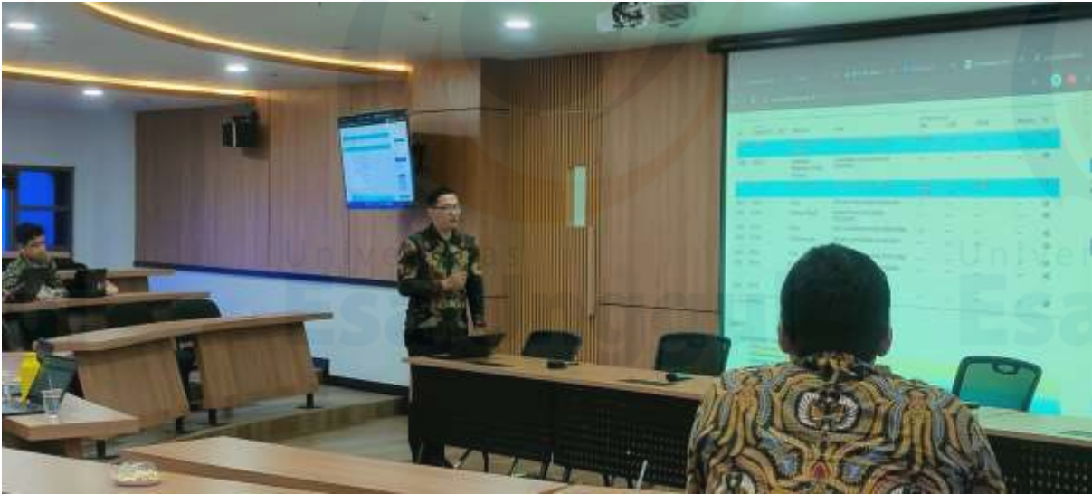
Sesi sharing knowledge bersama tim pengelola jurnal ilmiah fakultas/prodi