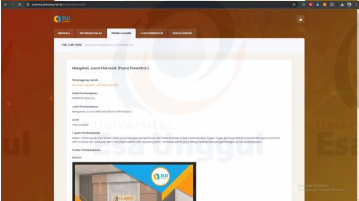
Proses ujian tertulis