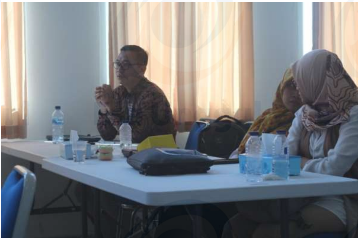
sesi tanya jawab mengenai permasalahan pengelolaan jurnal ilmiah (hari pertama)