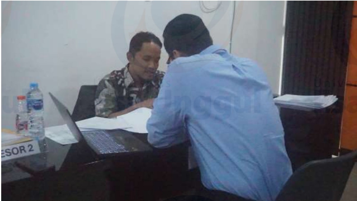
Proses ujian praktek dan wawancara dengan asesor BNSP